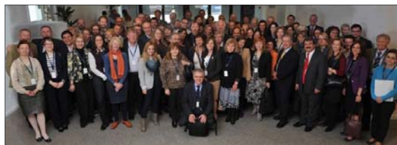
The ELGPN family photo at the Copenhagen Plenary meeting