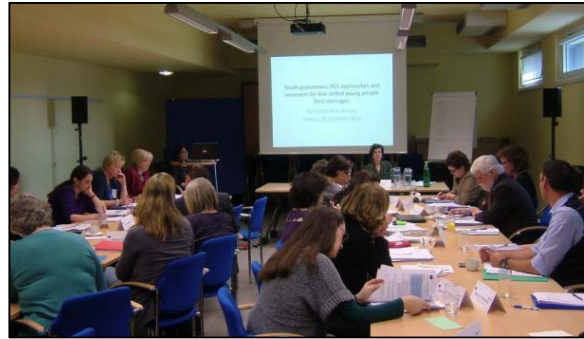
Peer Review "Youth Guarantees", Vienna 2011

to PES Dialogue: "Youth Guarantees: PES approaches and measures for low-skilled young people" 6 .